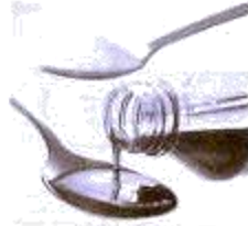
6. teaspoon _____