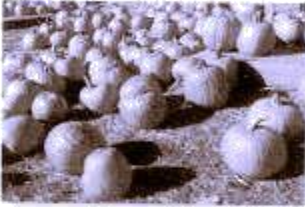
2. plenti _____