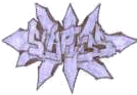
3. shape _____