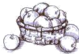
10. basket _____