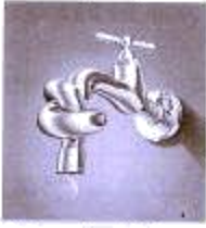
1. water _____