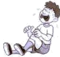
8. pain _____