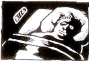
5. sleep _____