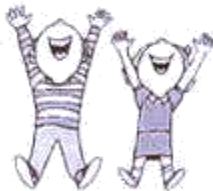
4. joy _____