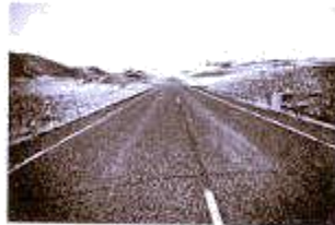
9. end _____